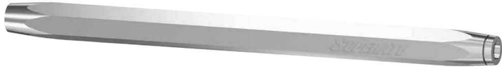
2 x Tie Rod Shaft