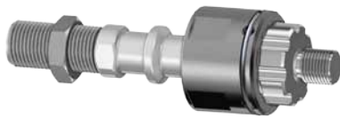
2 x Ball and Socket