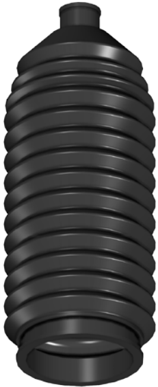
2 x Boot