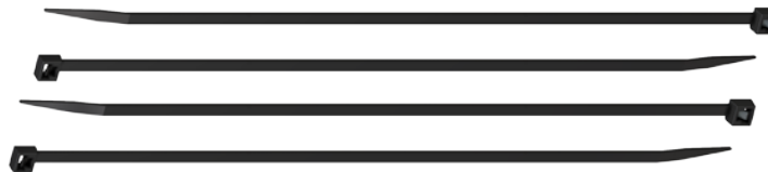
4 x Zip Tie