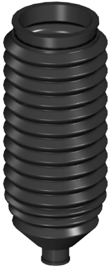
Boot x 2