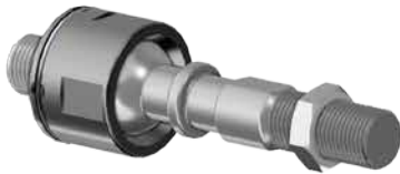
2 x Ball and Socket