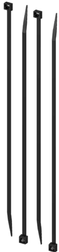
4 x Zip Tie