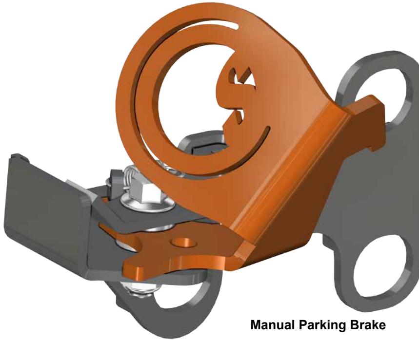
Manual Parking Brake

Do not discard packaging until product has been successfully installed.